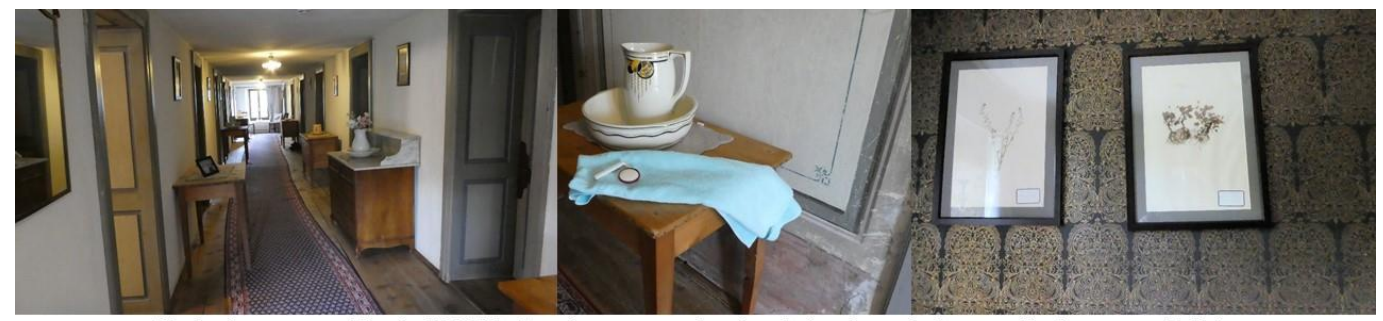
The bedrooms are all lined with Valais fir and spruce wood and each floor has a bathroom with showers and toilets.

However in many ways it is run as a Hotel with a full bar and terrace serving food and drink all day to residents and passers by alike. The outdoor terrace has wonderful views across the valley.