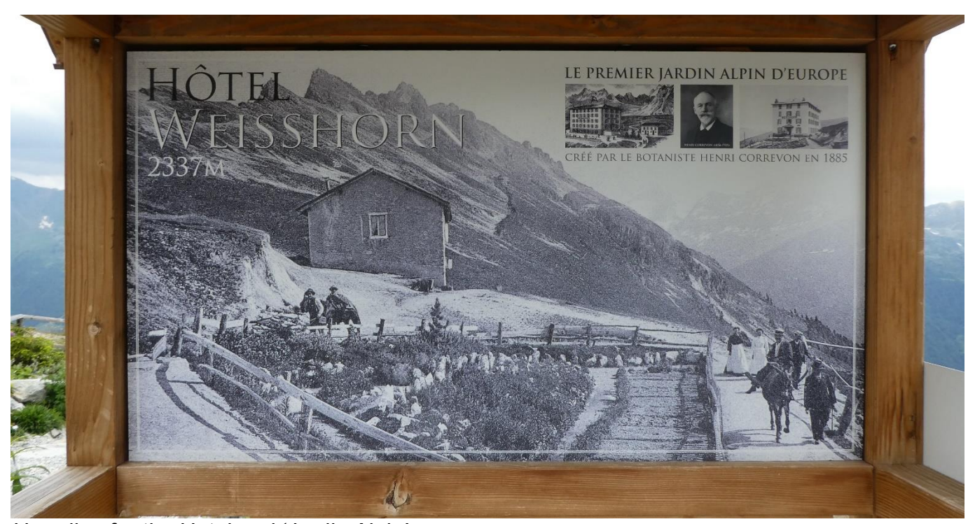
Hoarding for the Hotel and 'Jardin Alpin'

The Hotel was opened around 1884. Initially the ground floor was made of stone and the first floor of wood. The Alpine Garden, which still exists, was opened in 1885 and used as a test station for the Jardin Alpin in Geneva.